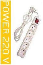
POWER 220 V