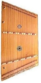
6 PSALTERY L 7 PSALTERY R