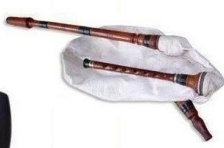
13 BAGPIPE DRONE 14 BAGPIPE MELODY